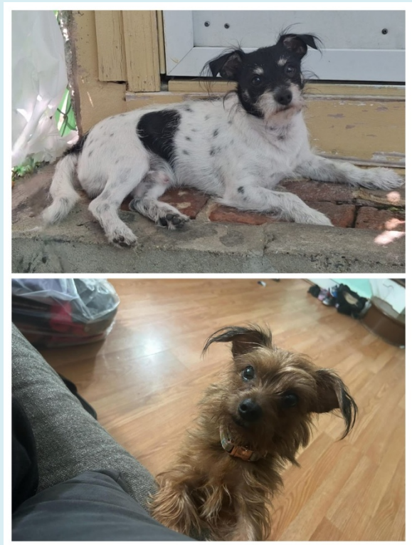
Lilo (top), Bella (bottom)